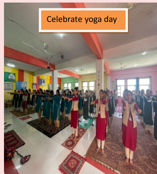
Celebrate yoga day