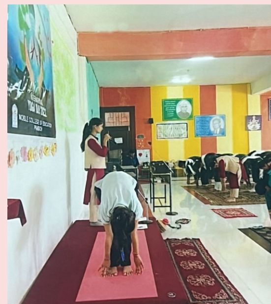
Celebrate yoga day